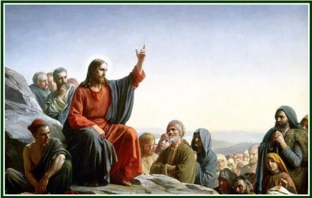
An image of the Prophet of Nazareth

..... W e allude to those [Christians] whose faith in their respective churches is pure and sincere, and those whose sinless lives reflect the glorious example of that Prophet of Nazareth, by whose mouth the spirit of truth spoke loudly to humanity. Such there have been at all times.