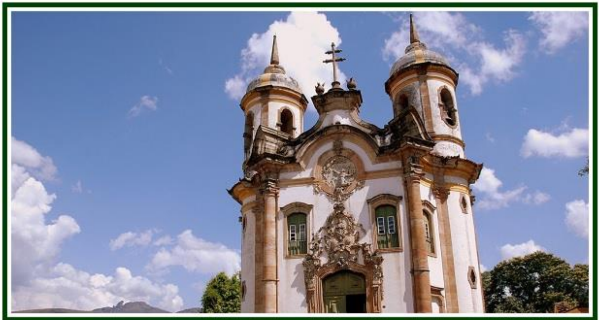
The Church of St. Francis of Assisi, in the city of Ouro Preto, Brazil

Once unfettered and delivered from their dead-weight of dogmatic interpretations, personal names, anthropomorphic conceptions and salaried priests, the fundamental doctrines of all religions will be proved identical in their esoteric meaning.