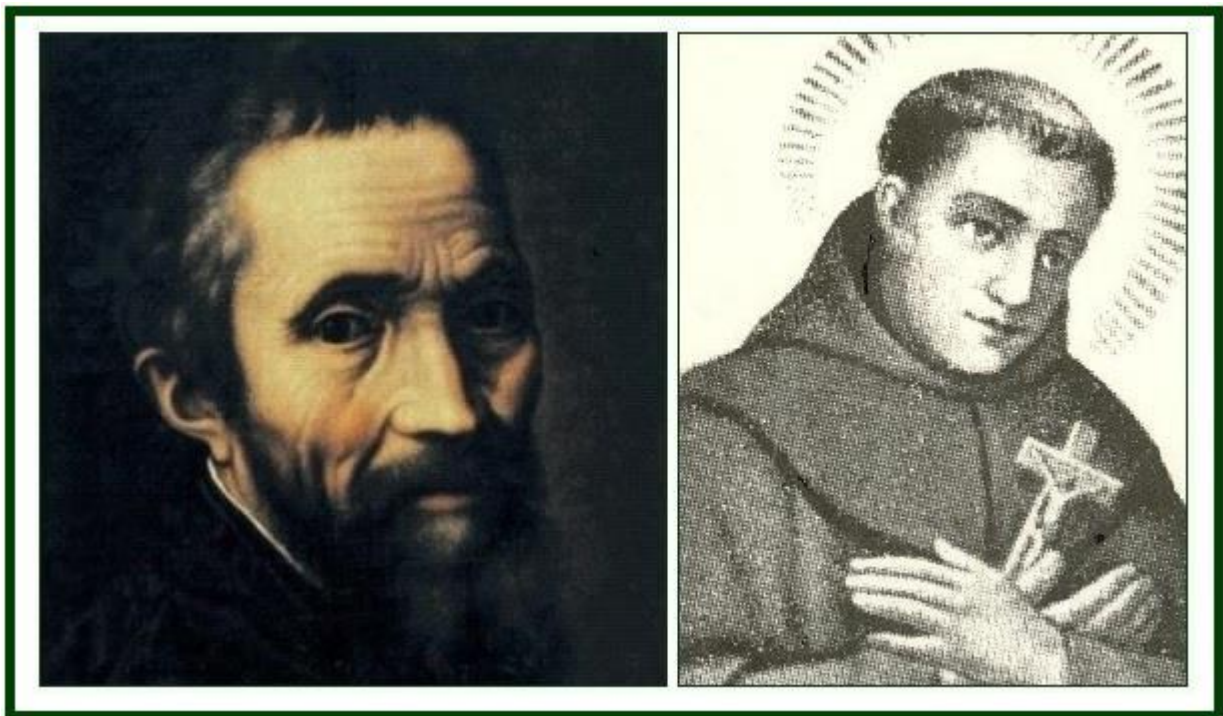
Michelangelo (1475-1564) and Amadeus of Portugal (1420-1482)

Click and see Helena Blavatsky’s article “ Star Angel Worship in the Roman Catholic Church ”.