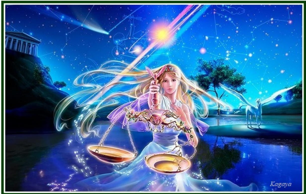
From the article “The Lesson of the Sun in Libra”

On 07 November we had 2789 items in the associated websites, including texts, books, poems, audios and videos. Of these, 03 items were in Italian , 20 items were in French , 203 in Spanish , 1269 in English and 1294 in Portuguese . [1] The following items were published in English and Spanish between 16 October and 07 November 2020: