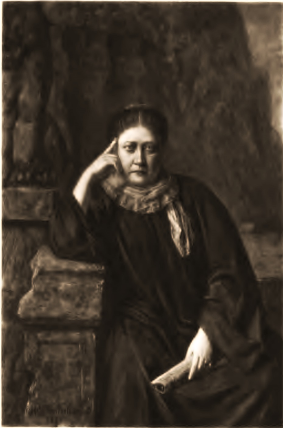
Portrait of Madame Blavatsky