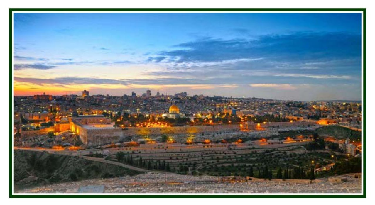
Jerusalem, the capital of Israel

Well-known facts can be denied or "forgotten" by public opinion and cultural consensus as long as they are politically inconvenient.