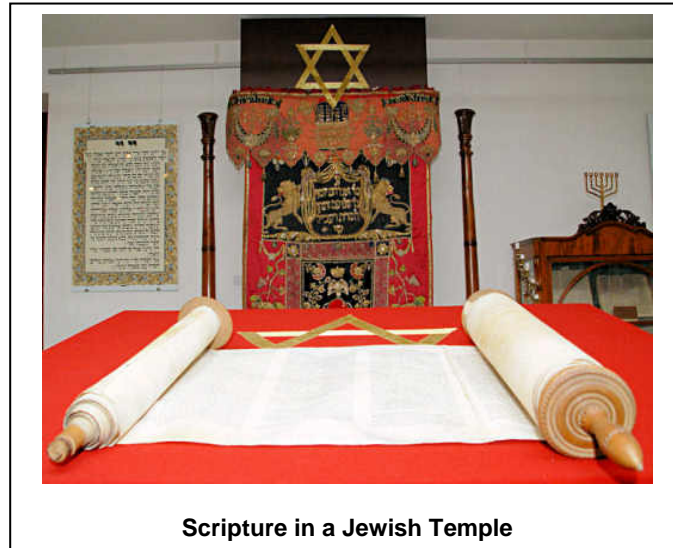
Scripture in a Jewish Temple

[ The present article is reproduced from “ The Theosophist ”, India, January, 1885, pp. 85-86. Original title: “ Aphorisms of the Sages ”. We have numbered the axioms. (C. C. A.) ]