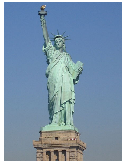
Statue de la Liberte, New York

The price of Liberty is eternal vigilance