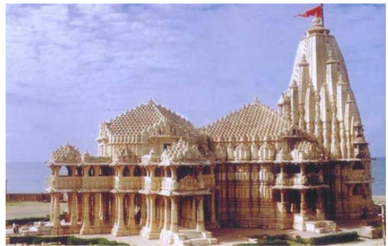
Dwarka temple, Delhi