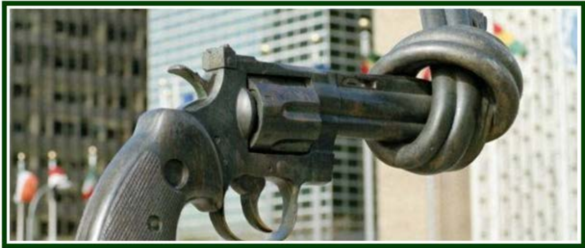
“Non-Violence”, a statue at the United Nations headquarters in NY City, also known as “The Knotted Gun”

On the 6th and 9th of August, 1945, the Japanese cities of Hiroshima and Nagasaki were destroyed by atomic bombs.