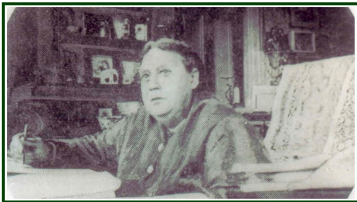
Helena Blavatsky (1831-1891), working in her office

T he “Mystery of Buddha” is that of several other Adepts - perhaps of many. The whole trouble is to understand correctly that other mystery: that of the real fact, so abstruse and transcendental at first sight, about the “Seven Principles” in man, the reflections in man of the seven powers in Nature, physically, and of the seven Hierarchies of Being, intellectually and spiritually.