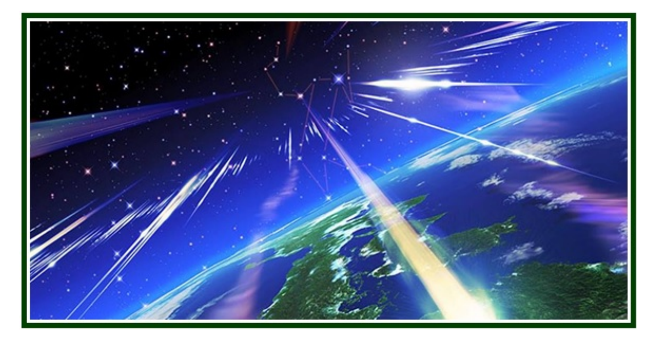
There are earthly roads for the body, and celestial ones for the soul

* Spiritual evolution depends on a voluntary effort, and it is also a natural process as inevitable as the sunrise. While seemingly paradoxical, these two aspects of evolution correspond to the hemispheres of human brain. The voluntary effort to attain truth is part of a wider and spontaneous awakening. The intuitive, involuntary aspects of enlightenment are never separated from the self-responsible journey to divine knowledge.