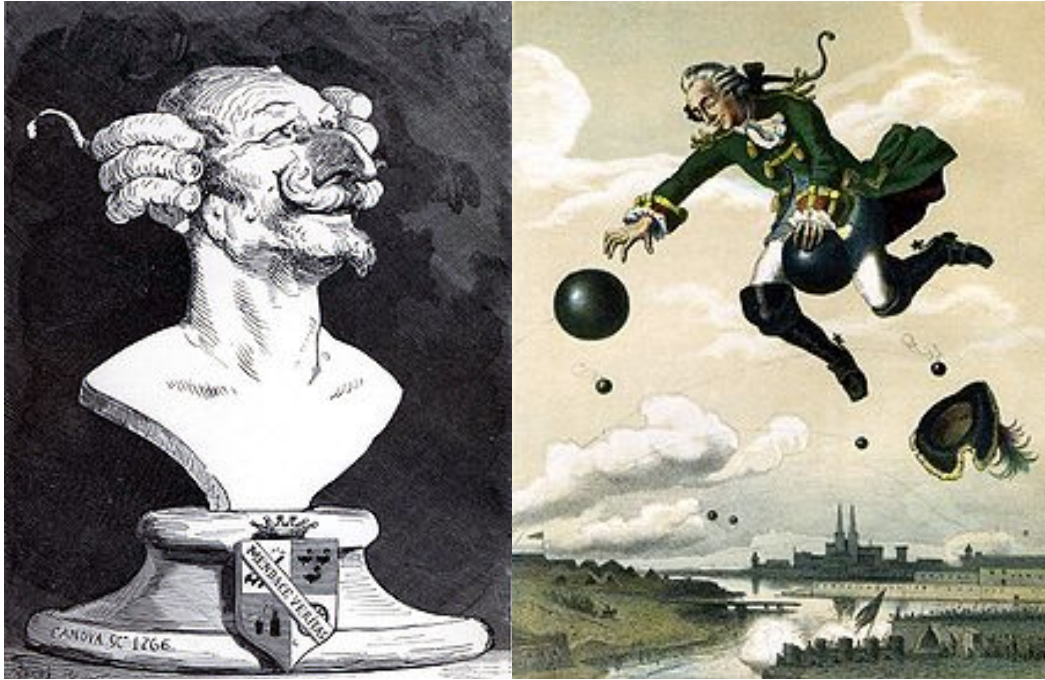
A homage to the Baron Munchhausen (left) and an image from his adventures

Theosophical students have started a research project dedicated to the comparative study of the works of the Baron Munchhausen and those of the Catholic priest Charles W. Leadbeater.