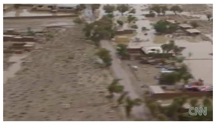
CNN footage of Pakistan's flooded areas

The monsoon season began and Pakistan is being devastated by heavy flooding. According to the country's prime minister this is the nation's "worst-ever calamity". More than 2 thousands deaths, 4 millions of homeless and at least 20 million people have been affected by this natural disaster.