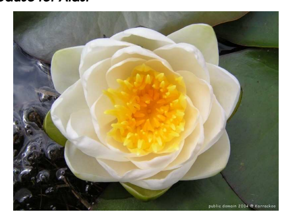
The White Lotus

Therefore, we must interrupt this chain of cause and effect. We Theosophists have the function to open man's heart for true love. We should be ourselves good examples. This is the only chance we have to root out the main cause for Aids.