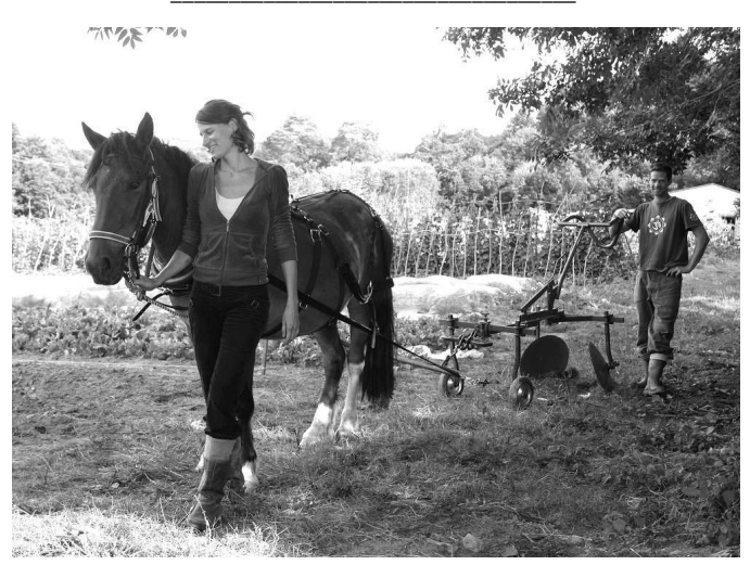
In 2010 the UK Chagford community agriculture initiative started using pony power to cultivate their two acre market garden with excellent results.