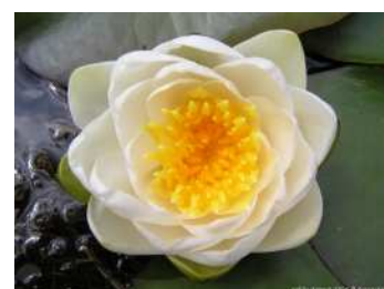
The White Lotus

(6) "Living the Higher Life", Reprinted in "Theosophy" magazine, Vol. I, p. 301. Also Vol. XII, p. 446.