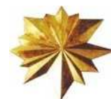
The golden symbol of Sun